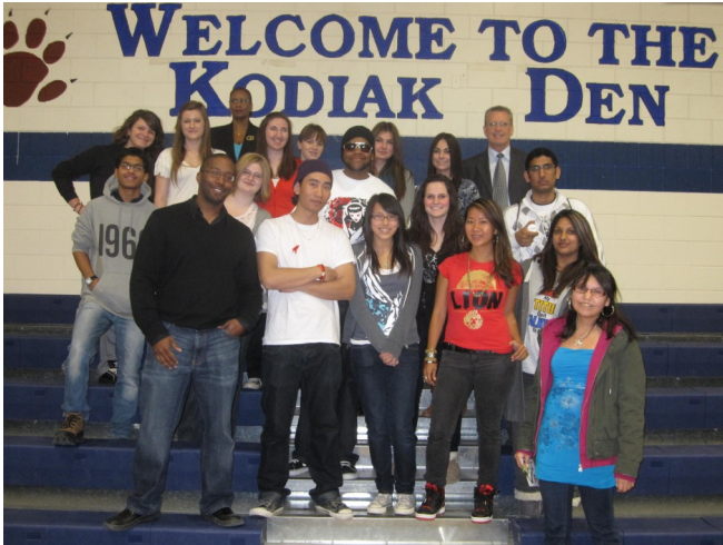
River East Collegiate: One of our first schools in the network!

Manitoba's network has sixteen schools. We are: