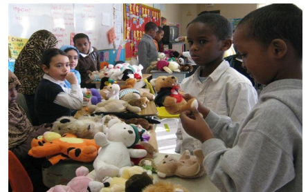
Preparing the teddy bears for their new homes!

Adopt a Village: Al Hijra School -The grade 3s had a very successful fundraiser. We sold over 200 teddy bears and raised $ 400.00! The money went to buy 3 goats and 1 cow that were given to women in Kenya through the "free the children Adopt a village program". We all feel good knowing that we are helping some children in Kenya so they can quit their jobs and go to school. Stay tuned for our next fundraiser in early summer.