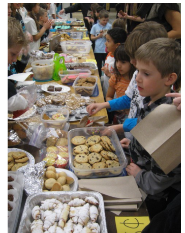
Bake sale for Haiti

It is truly inspiring to hear the voices of students plan forums, support causes, voice their opinions. The battle cry in many of our schools is UNESCO!!!