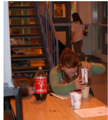
Making a filtration device