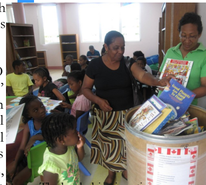
The book drive in action