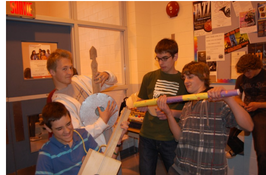
Making music with instruments made from recycled objects