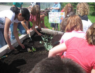
Planting the seed!